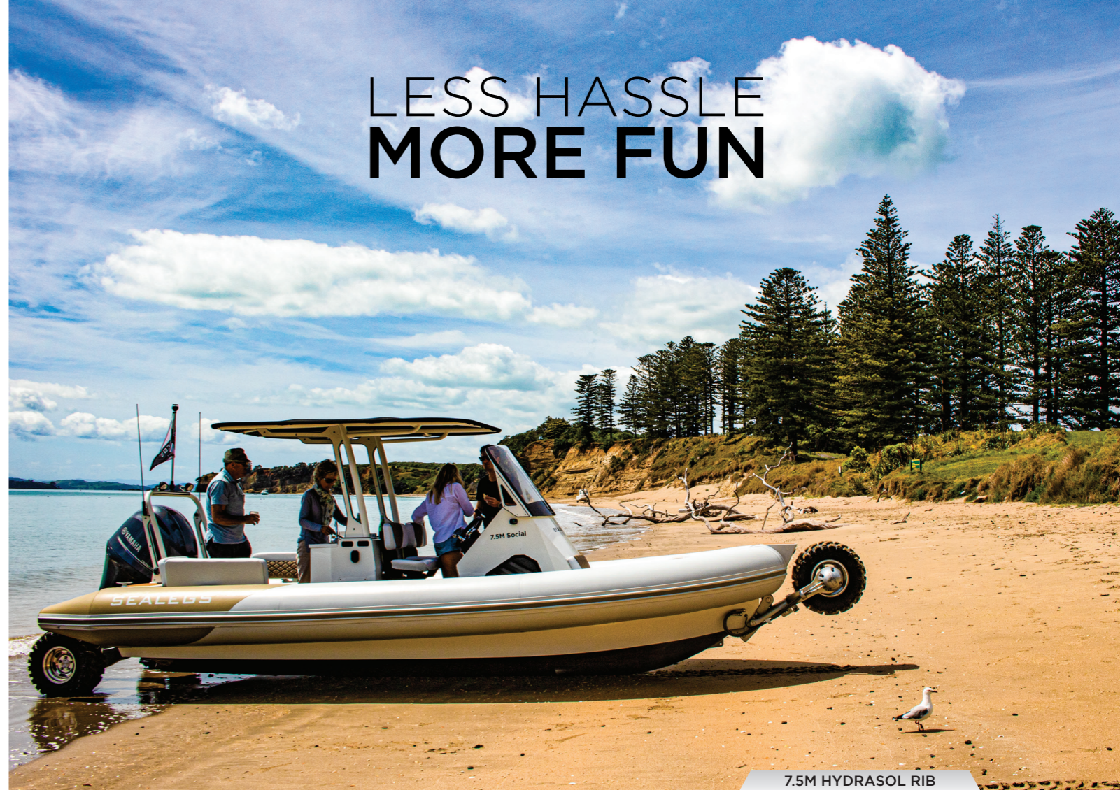
7.5M HYDRASOL RIB

Range is calculated on 90% of the fuel capacity.