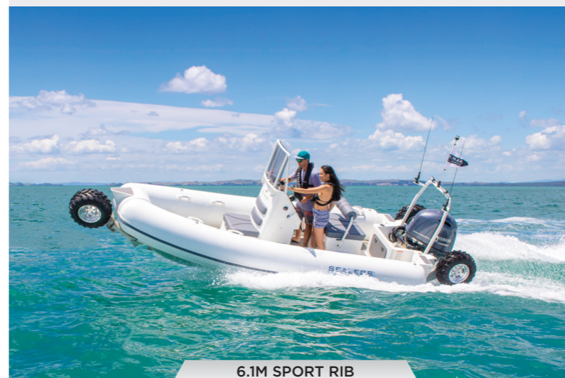
6.1M SPORT RIB