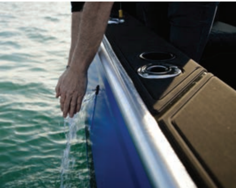
The cleverly designed, knee-activated sea water hand wash.