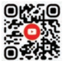
SCAN THE CODE TO WATCH THE VIDEO

The helmsperson doesn't need an Airbus A380 pilot's licence to operate the 8.6m Alloy MAX.