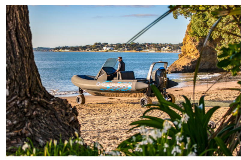
Top & Bottom Right: Doing what it does best.

Bottom left: The Alloy console has a prominent one piece acrylic screen.